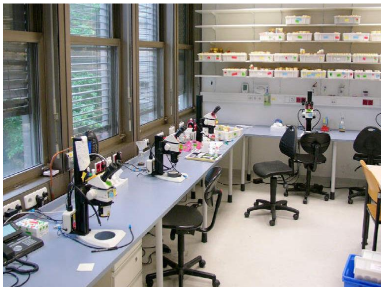
Figure 3: Typical Drosophila melanogaster laboratory (DeRose et al., 2016)