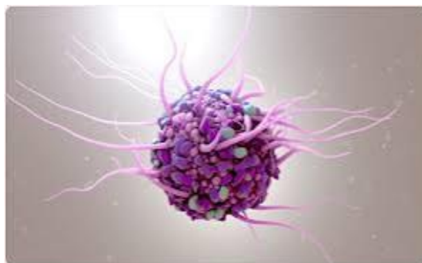
Human Cell Lines